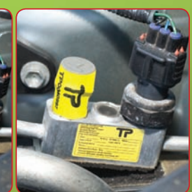
3. Apply sticker and record serial number

Tracerline TP-30 Tamper-Evident Sleeves come in a convenient storage bag complete with 10 sleeves with serial numbers, matching stickers and tape.