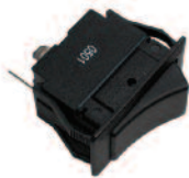
Part #65131 (without light)