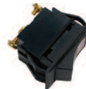
Part #65134 (with light)

Snap in place mounting fits 0.830" x 1.45" cut out. Panel thickness from 0.093" to 0.187"